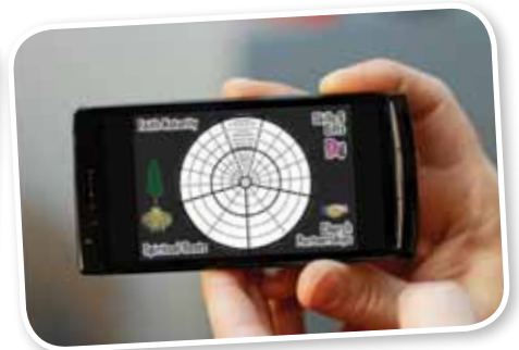
Concept artwork for the new Leadership Development mobile application.