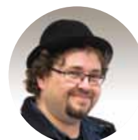
Lochy Cupit Creative Arts Network